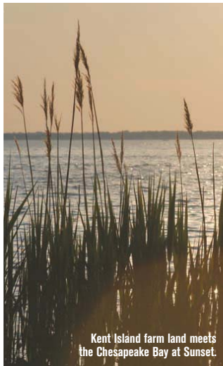
Kent Island farm land meets the Chesapeake Bay at Sunset.