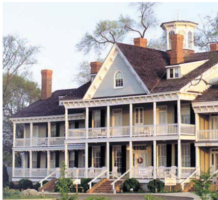
Historic Kent Manor Inn has helped turn Kent Island into a vacation destination.

strip-mall. Its neighbors are a dollar store and a laundromat. But don't be put off by its highly unlikely location. This tapas restaurant and bar, with a lazy-Susan on every table to make sharing easy, is a true discovery. As for the wine selection, Lisa's puts other restaurants to shame. It offers 50 reds and 50 whites at $20 a bottle. But if you insist on spending more, the wine-cellar stocks bottles up to $230.