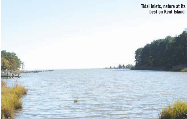
Tidal inlets, nature at its best on Kent Island.